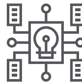
SOFTWARE & TECH ENABLED SERVICES